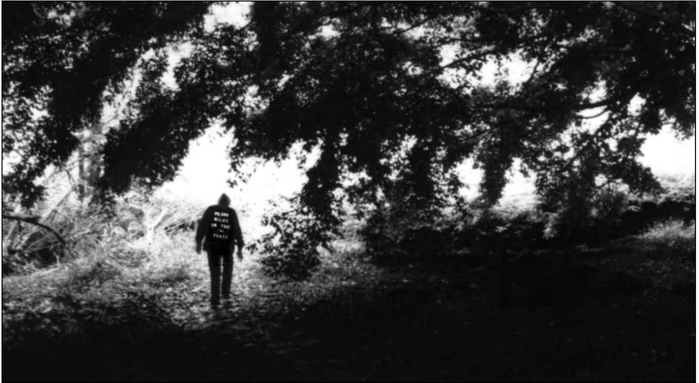
Peace Pilgrim led two inspirational trips in the last years of the pilgrimage. This photo was taken on the Hawaii trip of 1980 and shows Peace walking toward the ocean.