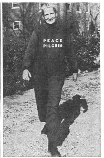
PEACE WALKS IN NORMAN—"Peace Pilgrim" left Norman today to continue her 10,000-mile walk for disarmament. Peace has walked 7,400 miles so far, carrying only a comb, tooth brush and her unanswered mail in her pockets.