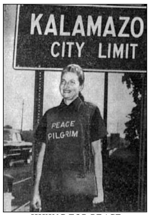
HIKING FOR PEACE