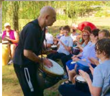
A rousing drumming session leaves everyone in good spirits.