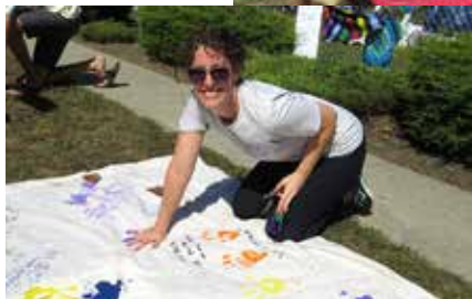
Colorful handprints and fingerpainted wishes for peace are among the fun, artistic offerings of the day.