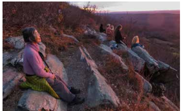
Friends enjoy the sunrise on the Appalachian Trail during the 2015 Retreat.